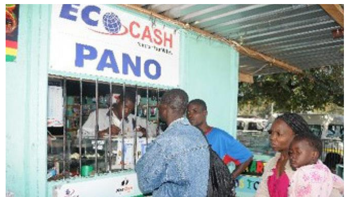
EcoCash customers are cashing out money at an EcoCash agent

'Finance was the catalyst in the whole process,' he said. 'The finance team stood at the forefront and put all the value chain departments and elements of the entire ecosystem together to build a model which was agile, scalable, that would survive the test of time even if it went through a patch of evolution.' The team led in designing and producing timely financial reports, engaging investors and analysing performance.